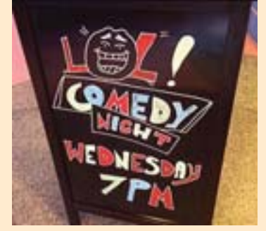
Submitted by Tania Sheppard

Looking for a way to get out of the doldrums of daily life?