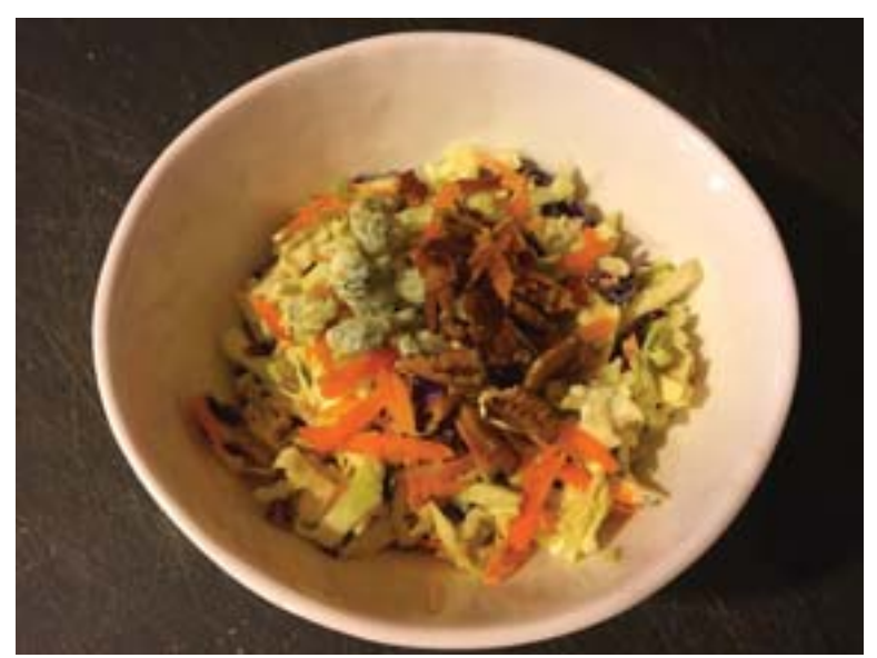
Blue Cheese Coleslaw